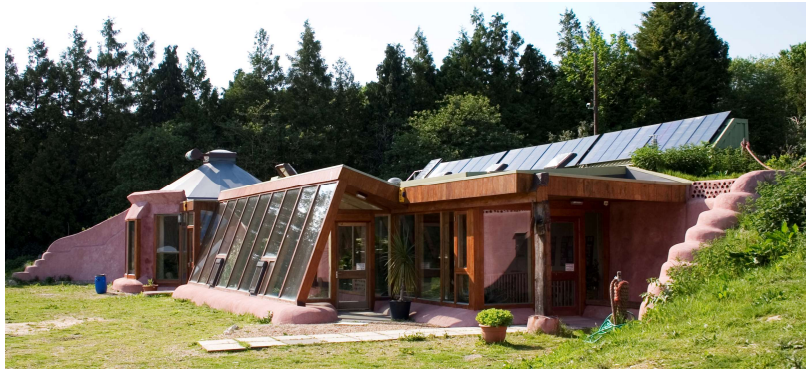
Fig. 2. Example of Earthship - Brighton Earthship [3]

Figures 2 and 3 show examples of built earthships.