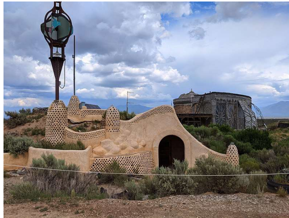
Fig. 3. Example of Earthship [42]

Earthships are located in more than 40 countries and are located across all the climatic zones [7]. Their purpose ranges from residential buildings or schools to hotels or museums.