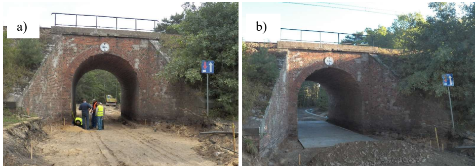
Fig. 4. View of carrying out works on the bridge structure: a) preparing the road bed, b) preparing the expansion slab under the viaduct

Due to the necessity for the geometric correction of the access roads to the structure, an appropriate surface drainage system was designed, which serves to drain water outside the road crown while maintaining adequate slopes of the gradeline.