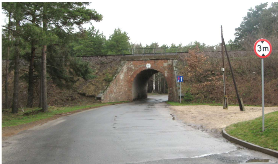
Fig. 1. General view of the railway viaduct

A general view of the described viaduct has been presented in a photograph in Figure 1.