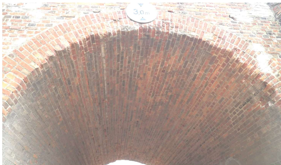
Fig. 2. View of the outline of the brick vault of the railway viaduct

As a result of the uncover, the following was confirmed: