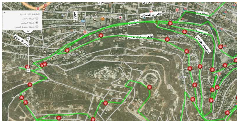
Fig. 2. Portion of the optimal solution of the GA, where the red spots represent dumpsters

Regarding time saving in SW collection, from the collected truck GPS data, each truck moves an average of 45 Km/hour, then the saving in the driving time would be about 4.6 hours per truck. That is about 2 hours 19 minutes per truck