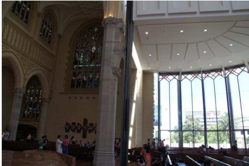
Fig. 5. View of the combining area of the cathedral existing structure with an added aisle. Visible pillar of steel structure next to the historical pillar made of sandstone