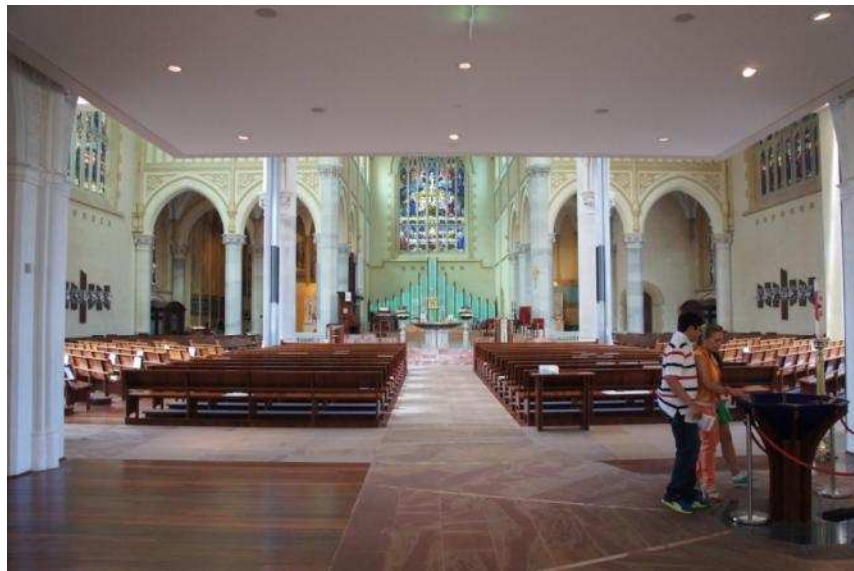
Fig. 4. View of the interior of the cathedral from the entrance. Visible effect of increasing the usable space of the object by mounting double-sided aisles and additional lighting