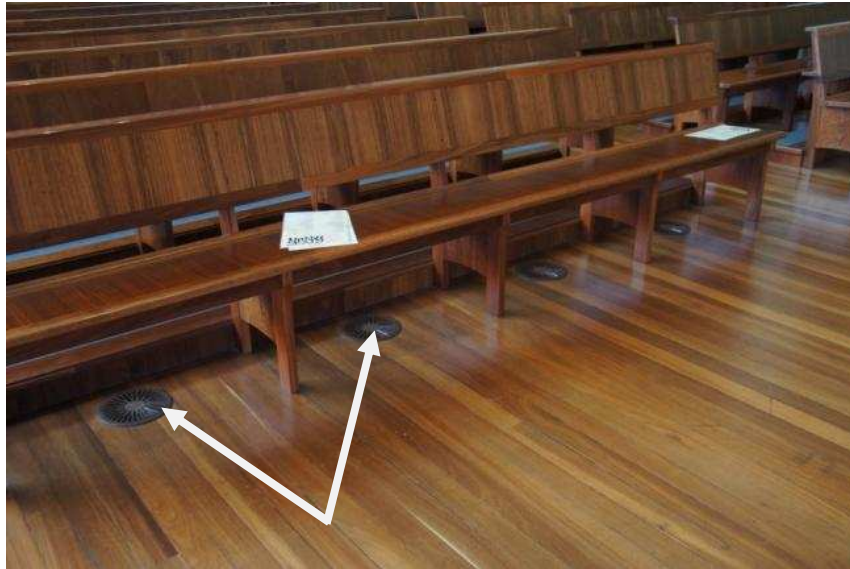
Fig. 7. Way of solving heating system through the use of air supply grilles under the seats of benches

In the photographs, listed in figures 7 and 8 one shown an example of the details of used solutions of heating and ventilation systems.