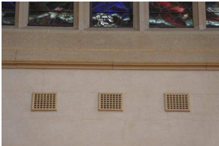
Fig. 8. Detail of the elements of the ventilation system - exhaust grilles. Visible effect of properly chosen elements to the historic character of the cathedral interior