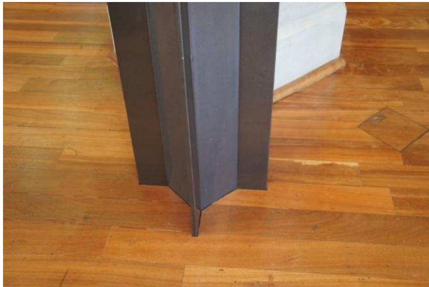
Fig. 6. Zone detail of "penetration" of column base by the design of the floor. Visible special section of the pillar limiting the number of stiffeners (battens and ribs) - in order to eliminate unsightly, in this case, architectural details