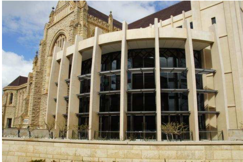
Fig. 3. A general view of one of the attached aisles, aimed at increasing the usable area of the object. Clear way of combining "the new" with "the old" - in the background view of the historic facade of the cathedral