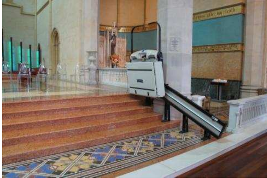
Fig. 10. Example of devices that facilitate the use of sanctuary for disabled and elderly people - ramp that allows overcoming the stairs leading to the altar

rebuilding plans one included the construction of additional parking spaces in the form of a full-scale underground car park, situated under the building of the cathedral.