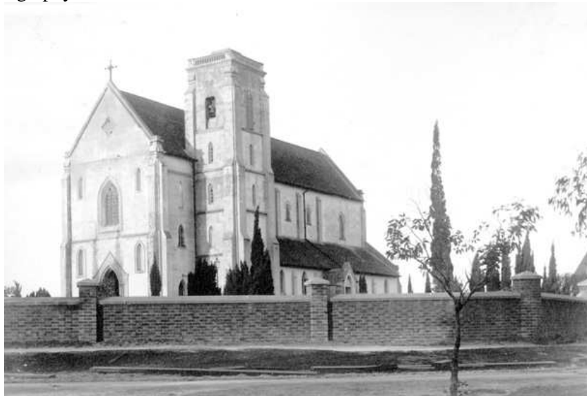
Fig. 2. General view of the sacral building in its original architectural design from 1894.

The main architect responsible for the construction work was Joseph Ascione - originally from Italy. The cathedral was consecrated and opened on 29 January, 1865. Figure 2 shows a view of the sacral building in its original form - photography dates back to 1894.