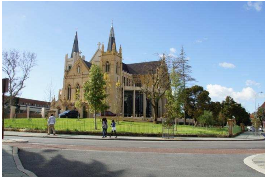
Fig. 1. General view of St Mary's Cathedral in Perth - Western Australia

In the photo placed in Figure 1 one presented a general contemporary view of St Mary's Cathedral in Perth (2014).