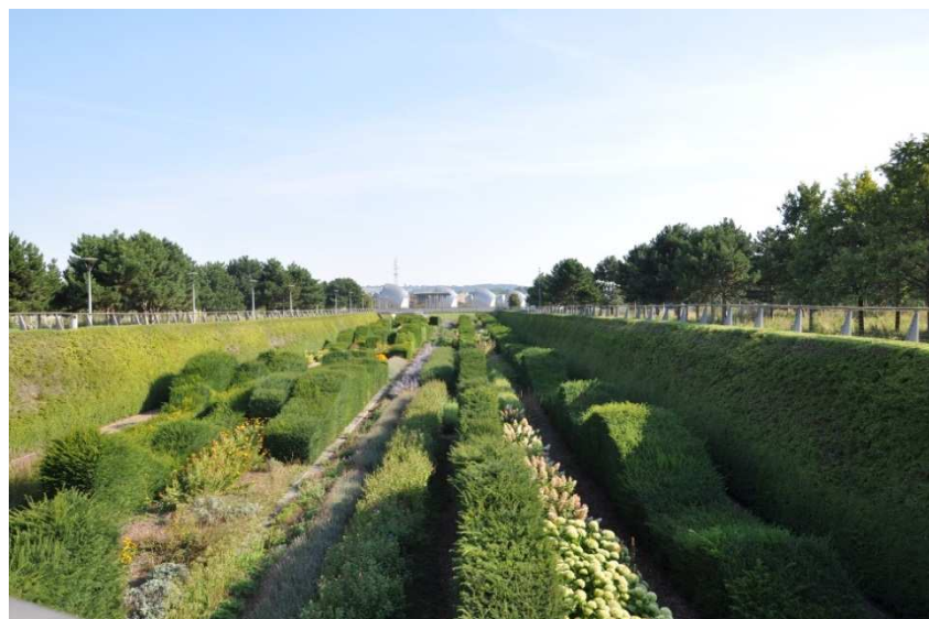
Fig. 2. Thames Barrier Park - "green dock"