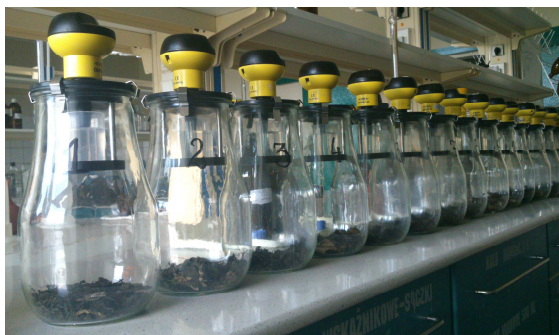
Photo 2. Oxi-Top set

The biological activity of the cellulose pulp was analysed using the AT 4 test. In order to carry out the respirometric test, a set including the OxiTop® OC 110 controller and MG 2.5 measuring vessels was used. The OxiTop apparatus consists of reaction vessels, adapters with fixing clamps and measuring heads. The stabilised material samples are placed in reaction vessels, which are closed tightly using an adapter with a measuring head fixed outside which contains an electronic vacuum pressure sensor. Inside each vessel, there is an attachment secured to the adapter, on which the CO 2 absorbent (photo 2) is placed. The measurement was performed at a temperature of 20±1°C for samples with a humidity ranging from 40 to 50%.