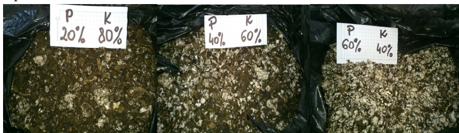
Photo. 3 Selected cellulose pulp (P) samples inoculated with compost (K)

During the studies, respirometric tests with various degrees of inoculation of the cellulose pulp with compost (40, 60, 70, 80, 90% of dry mass per sample) and tests for the compost (control tests) were performed. Two repetitions per each sample were made.