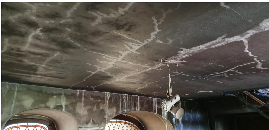
Fig. 5. Fire damage to solid ceramic brick wall and ceiling on wooden beams, visible cracks in plaster on wall and ceiling

The destructive effect on brick masonry elements of domestic animals, especially cows and horses, and birds, especially pigeons, should also be mentioned here. Animals contribute, among other damages, to the growth of moisture and the secretion of harmful salts that result in the development of destruction of masonry elements.