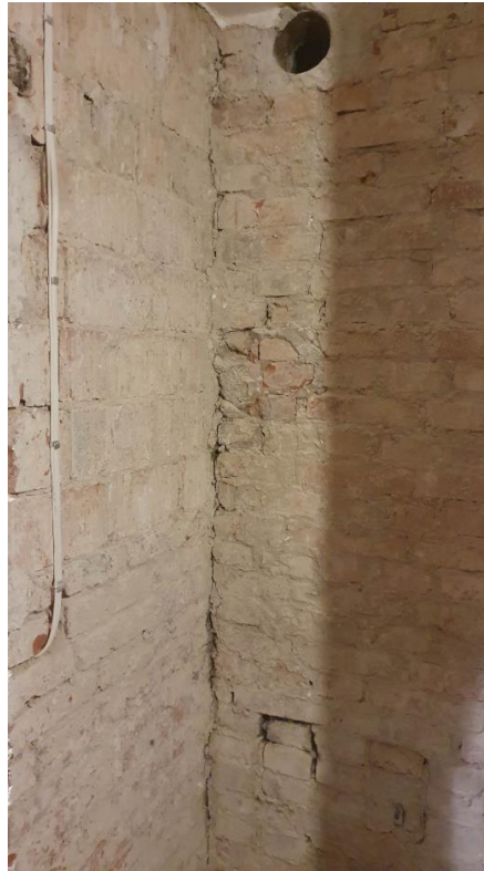
Fig. 13. No masonry bond between transverse and longitudinal interior walls made of ceramic solid brick

In terms of execution errors and shortcomings in historic buildings dating from a bygone period with regard to brick masonry, the following problems stand out: