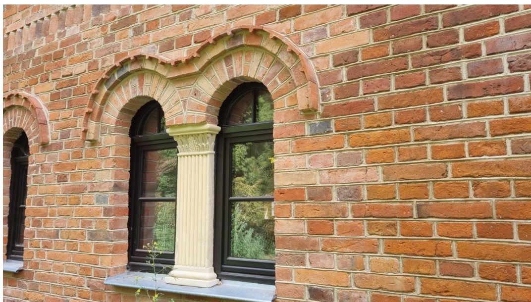
Fig. 19. Revitalization of historic solid ceramic brick wall using contemporary brick and ceramic tile and limestone details