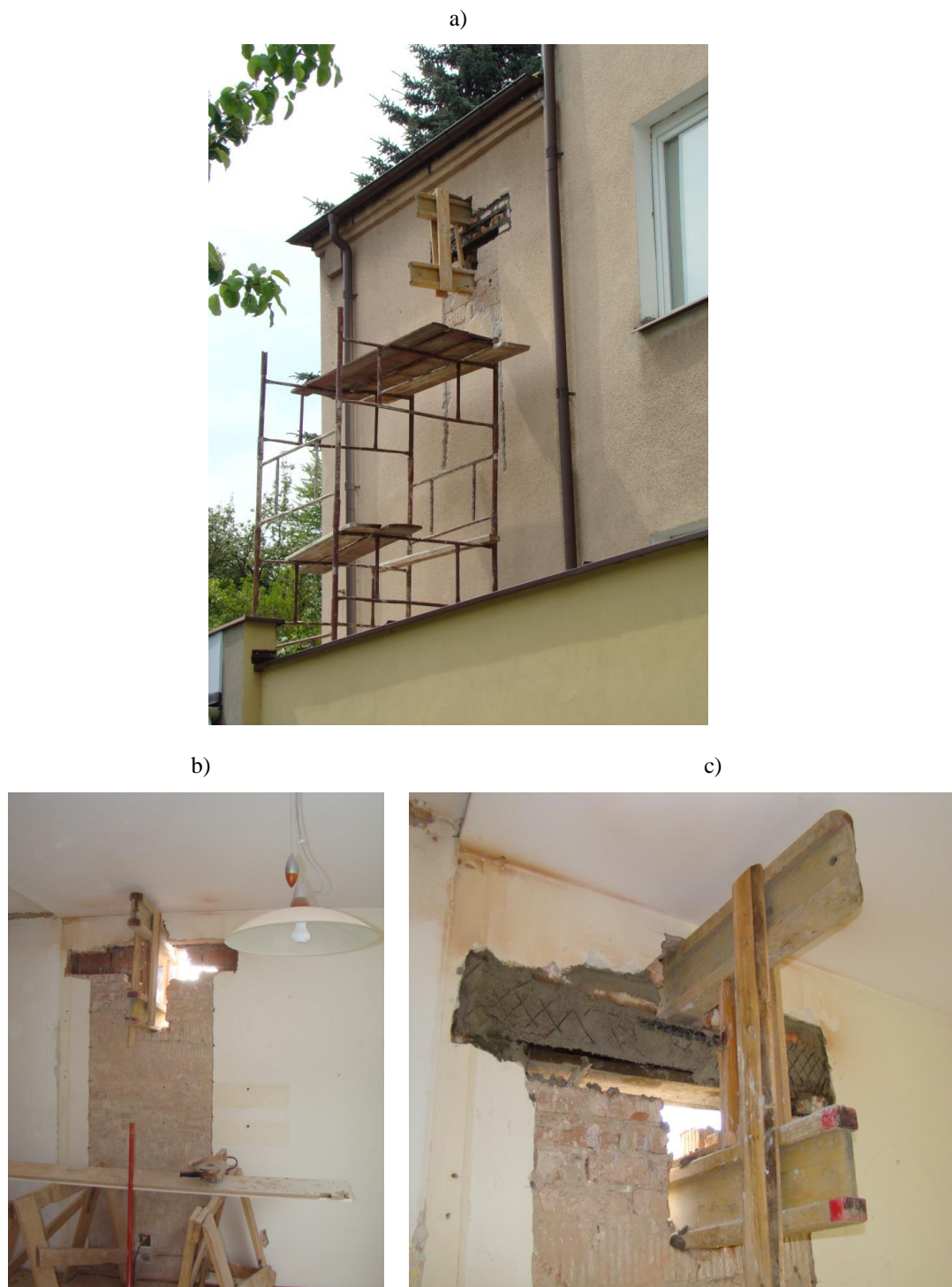
Fig. 16. Realization of the door opening in the layered external wall made of ceramic lattice bricks – stages of realization in the view from: a) exterior, b), c) interior