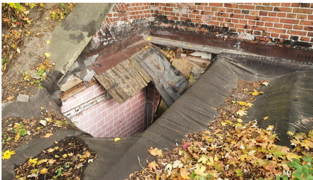
Fig. 15. Moisture damage to ceramic masonry as a result of water flooding caused by the collapse of a moisture-damaged and biologically corroded wood-framed roof: a) view, b) close-up