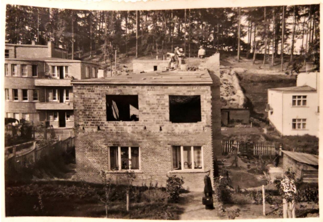
Fig. 12. Building with layered exterior walls (with air cavity), made of ceramic bricks: a) solid, at the level of the ground floor, b) trusses, at the level of the first floor