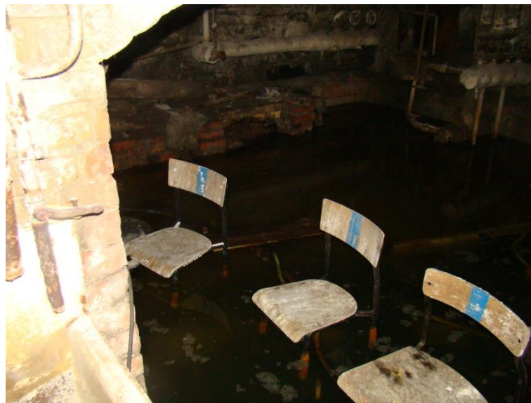
Fig. 2. Flooded basement of the building to a height of 0.45 cm above the level of the basement floor: the original groundwater level ~120 cm below the foundation level of brick footings (difference between the original state and the state shown in the illustration: ~265 cm)

As far as historic buildings are concerned, it is also often the case that cracking and displacement of individual parts of them, including masonry also occur in the area of old urban districts due to the collapse of formerly existing underground structures, such as multi-level underground parts, passages and canals.