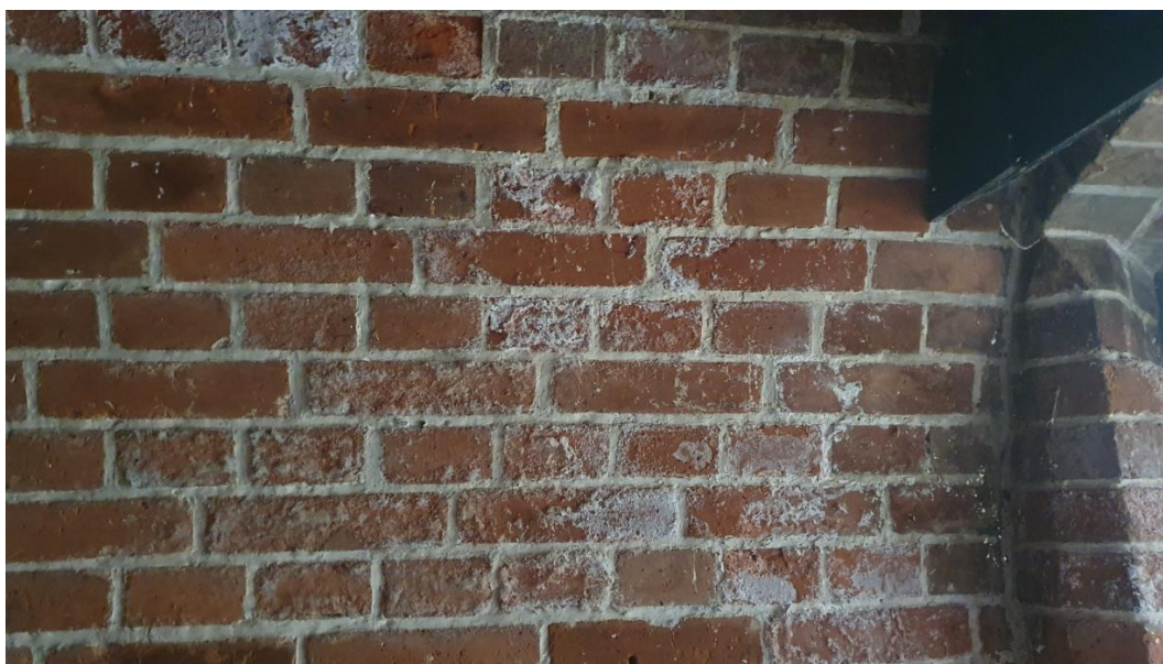
Fig. 4. Development of biological corrosion on the interior surface of the exterior solid ceramic brick masonry, visible cement mortar tight joint improperly executed in the past period during renovation work

Active bacterial and fungal activity can be recognized not only by the appearance of mold and plaques on structural parts, but also by the characteristic odor.