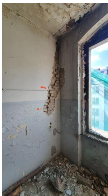
Fig. 11. Cracking of the internal transverse wall made of solid ceramic bricks at the point of connection with the external longitudinal wall in a building with ceilings on wooden beams that do not have frontal and lateral anchoring