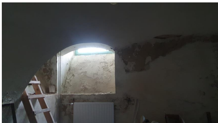
Fig. 7. Dampness of the external wall made of solid ceramic brick caused by the lack of vertical damp proofing in the part sunk in the ground

In the case of historic buildings from a bygone period, especially with regard to medieval and Gothic religious buildings, it should be remembered that their implementation was based on the professional experience of the builders of the time [25], [26]. Design documentation was simplified, or reduced to a drawing (painting) which, using modern terminology, corresponded to a conceptual design. The solutions adopted and directed for implementation were not supported by detailed static-strength calculations: this also applies to the construction of brick masonry and brick vaults, commonly used in religious buildings. However, taking into account the time realities inherent in the period of implementation of this type of buildings, it can be assumed that the main design errors and shortcomings include: