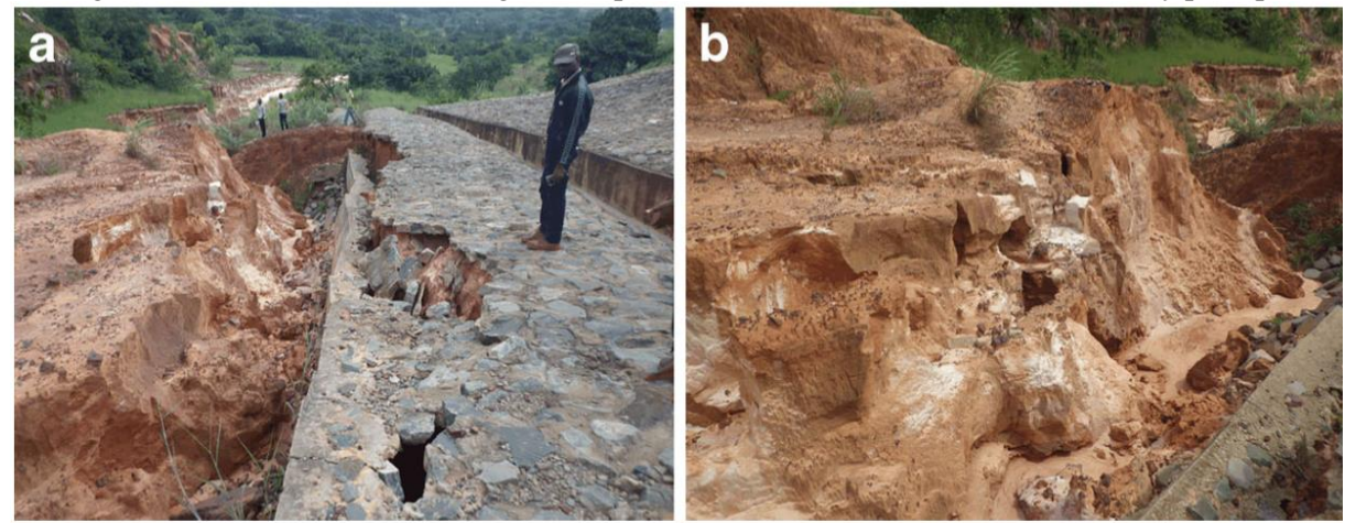
Fig. 4. Failure of prevention works due to instability in slope material [41]

improve slope stability and socio-economic benefits while addressing environmental hazards thereby enhancing community engagement and resilience towards climatic risks [43, 44]. In regions prone to landslides like Japan and Nepal, this challenge is made worse by climate-induced precipitation resulting in more sediment disasters and slope instability. Both countries employ multiple slope reinforcement techniques such as drainage systems and rock anchors that are used for landslide control [45, 46]. It has been shown that the development of underground drainage systems can significantly minimize the rise of groundwater level which leads to mitigating the slope instability caused by preferential shallow water flows during heavy rainfall [47]. Further, geosynthetics and other structural measures including retaining walls [46, 48] have been pointed out as important for the improvement of slope stability although the effectiveness of these might be dependent on local conditions and community perceptions.