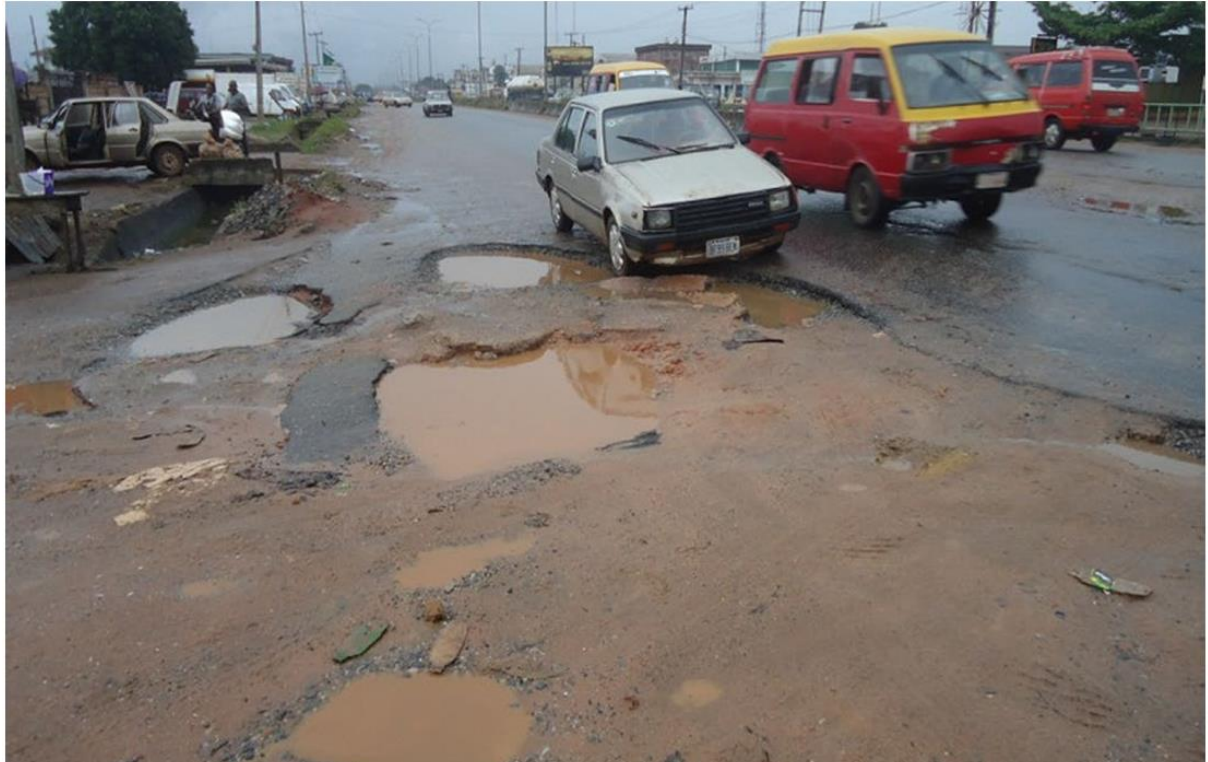
Fig. 3. Road failure aided by intense rainfall [36]

terms of road construction on lateritic soils, have been found in both Brazil and Southeast Asia, giving rise to innovative solutions designed to increase road resilience. Mechanical performance of reclaimed asphalt pavement and lateritic soil integration has been shown to have been improved particularly with a 25% reclaimed asphalt pavement mixture with reduced deformation and cracking [37]. In addition, the use of hydrated lime and liquid stabilisers has been shown to enhance the strength and the load-bearing capacity of lateritic soils and optimized combinations resulted in significant improvement in California Bearing Ratio (CBR) values [38]. Improving drainage systems and the use of soil stabilisers (e.g., lime and fly ash) in Southeast Asia has been shown to mitigate the problem of moisture sensitivity and extend road lifespan [39, 40].