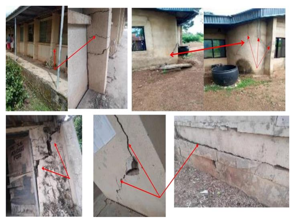
Fig. 2. Building foundation failures [3]

stability of the structure and reduce the settlement risks [34]. Ground densification techniques also contribute to reducing net excess pore pressures and foundation settlements [35].